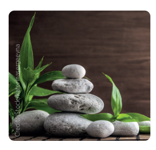
THE POWER OF YOUR PENSION

The investment option that lets you control how and where your money is invested