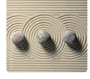
SELF-INVESTED PERSONAL PENSIONS (SIPPS)

The investment option that lets you control how and where your money is invested