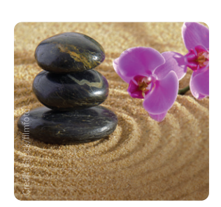
THE TAX BURDEN ON HIGH INCOME